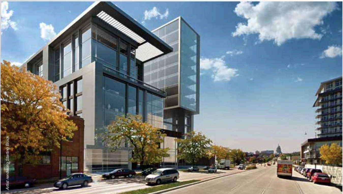
Artist rendering, Starting Block